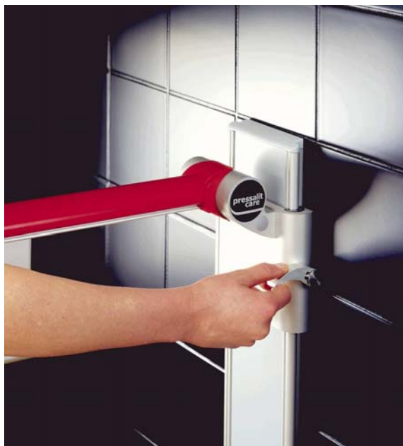
Top left: Toilet support arm and track system. Top right: 40cm vertical track R9900. Left: Toilet support arm R9308 slides on track system. Below: Locking mechanism holds support arm at desired height.